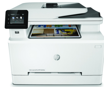
HP Color LaserJet Pro MFP M281fdn/M281fdw

Dynamic security enabled printer. Only intended to be used with cartridges using an HP original chip. Cartridges using a non-HP chip may not work, and those that work today may not work in the future. Learn more at: http://www.hp.com/go/learnaboutsupplies