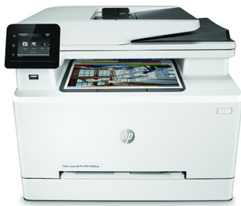
HP Color LaserJet Pro MFP M280nw

Make an impact with high-quality colour and increased productivity. Get the HP's fastest in-class two-sided printing speed and First Page Out Time (FPOT). 1,2 Scan, copy, and fax. Count on simple security solutions, and get easy mobile printing. 3